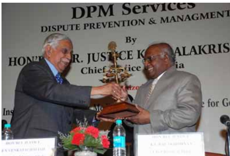
Mr. Justice M.N. Venkatachaliah handing over memento to the Chief Justice, Mr. Justice K.G. Balakrishnan